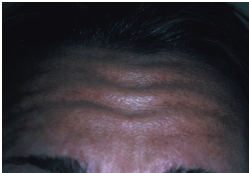
Figure 3. Shown here are forehead wrinkles before botulinum toxin A injections.

In conclusion, there are many noninvasive approaches to improve aging skin. Collagen formation can be increased with ablative laser. Skin tightening can be improved with the nonablative radio frequency devices. Skin smoothing can be accomplished with topical tretinoin. Skin toning can be improved with the near-infrared or the vascular-specific