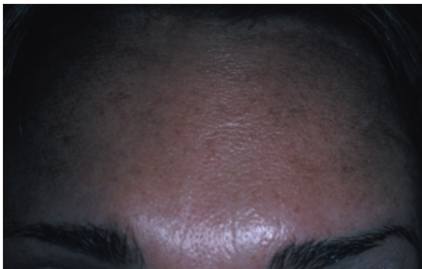
Figure 4. Botulinum toxin A injections caused marked diminution of forehead wrinkles, shown here two months after injections.

systems. Decreased hyperkinetic muscle tone can occur following botulinum Toxin A or B injections. Finally, increased facial fullness can be achieved with a variety of filler agents that are now available or soon to be available.