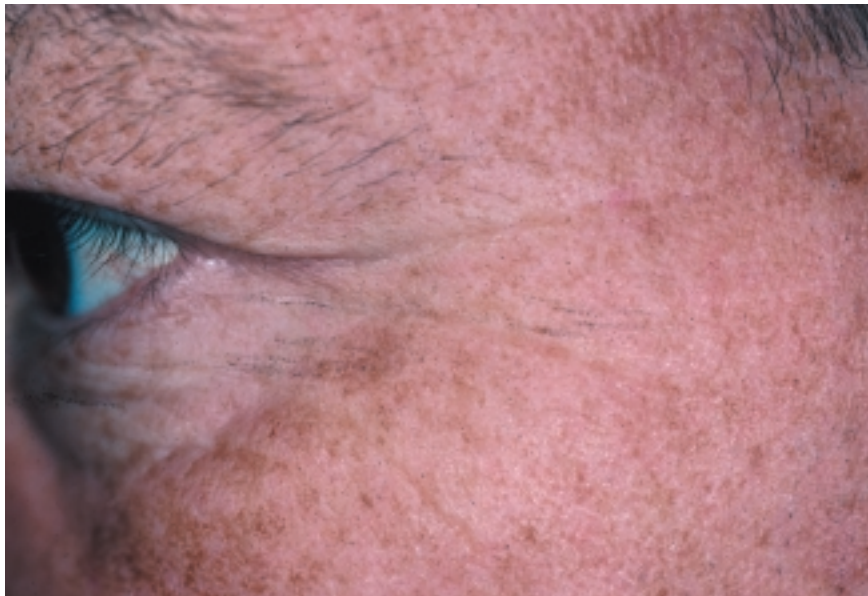
Figure 1. Shown here are fine wrinkles before treatment with a 1450nm Diode laser.