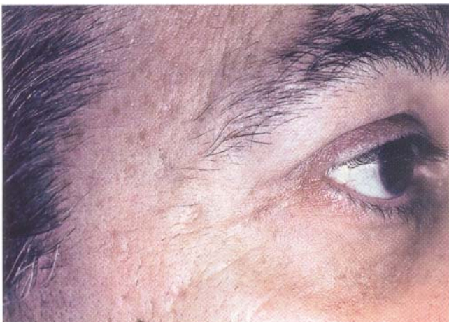
Figure 3. Deeper atrophic scars and pitted acne scars at baseline. This is a close-up view of Figure 2 highlighting the temple area.