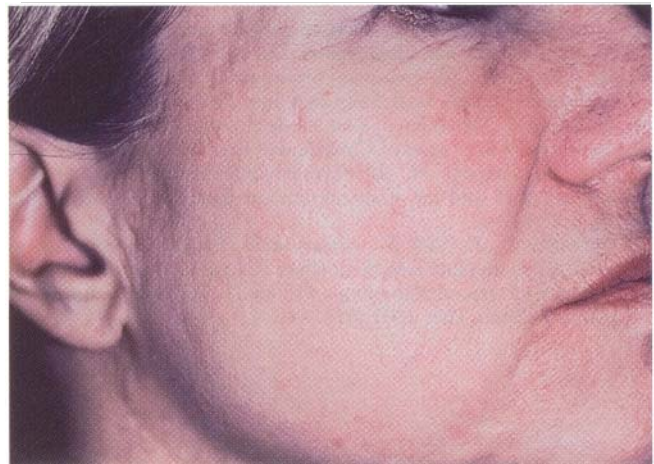
Figure 5. Atrophic acne scars at baseline.