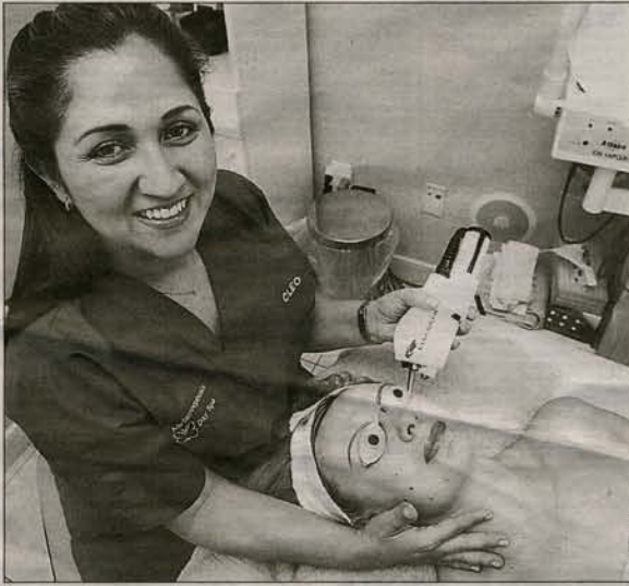
In a new wrinkle in face-lifts, a patient undergoes laser treatment.

Also, before scheduling treatment, check the credentials and license of your specialist. Ask to see before and after photos, and get the number of patients he or she has personally performed the treatment on. Finally, make certain an MD will